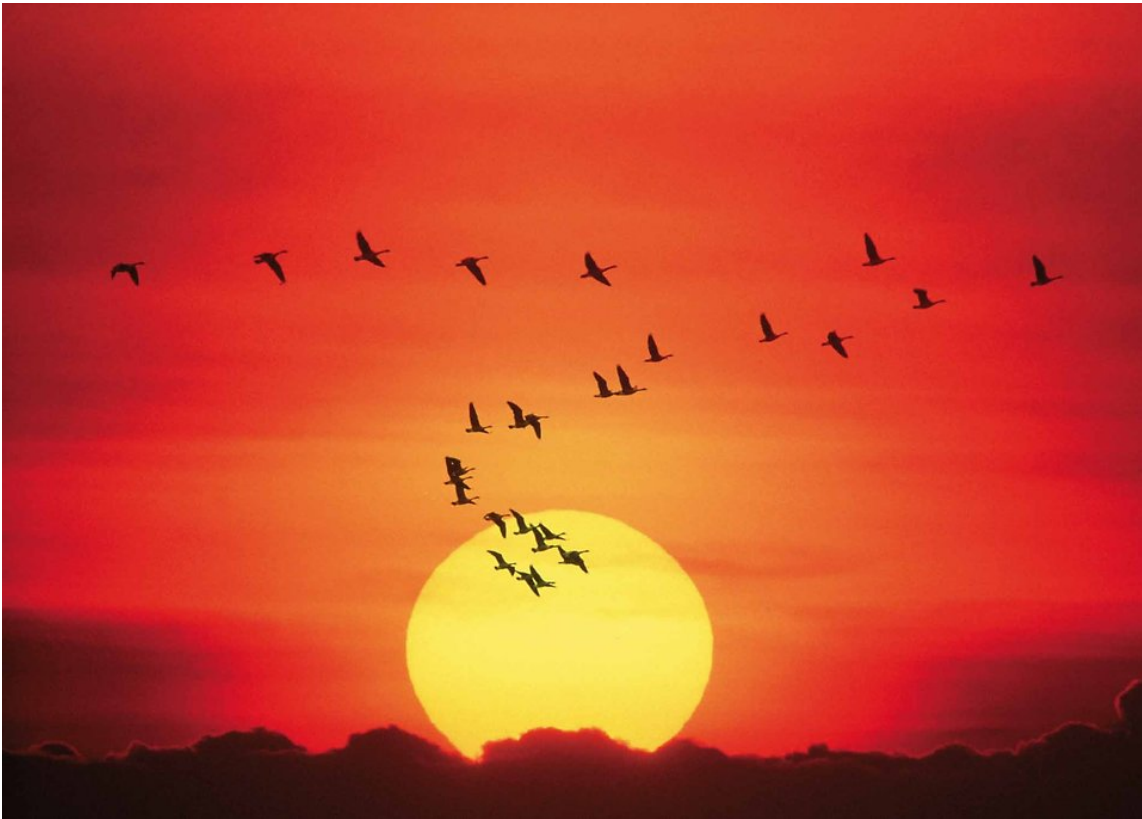
Figure 2: The setting Sun.

7. Derive a general formula for the Hour Angle (HA) of a source that is setting which is only a function of latitude of the observer ( \phi ) and declination ( \delta ) of the source. How would you modify this equation for the Hour Angle of a source that is rising? NOTE: Since LST = HA + \alpha , you can use this equation to figure out the LST of when a source with coordinates ( \alpha, \delta ) will rise and set from your location ( \phi ).