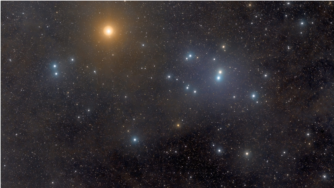
The Hyades Cluster of stars in Taurus